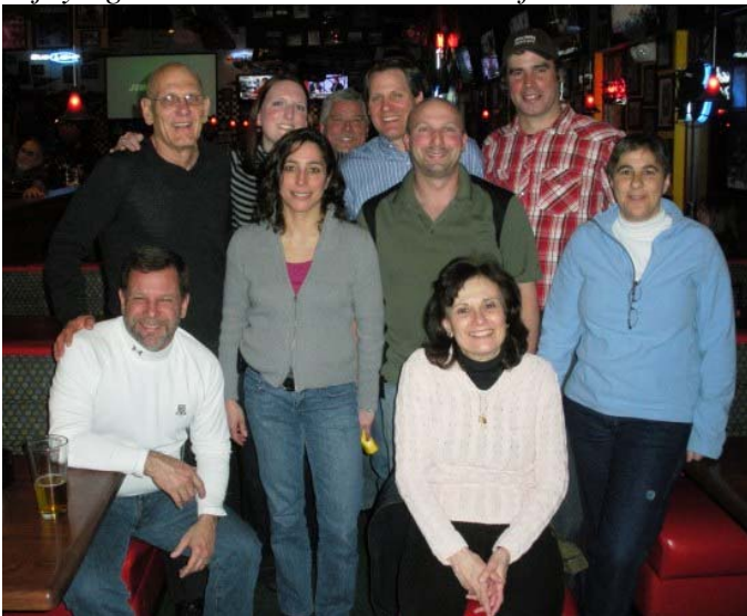
Pictured Below: A group of WRAPS members enjoying themselves at the State Conference.