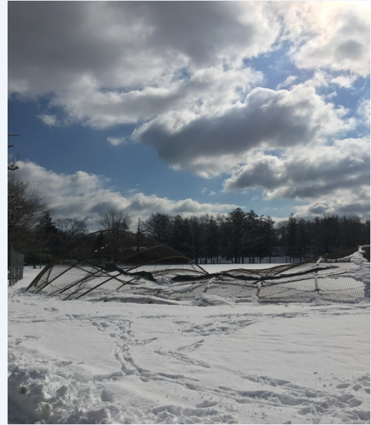
Photo Above: Staff at Rye Recreation arrived to work one morning to find one of their back-stops laying on the ground thanks to the heavy snow! Mother nature wins every time!