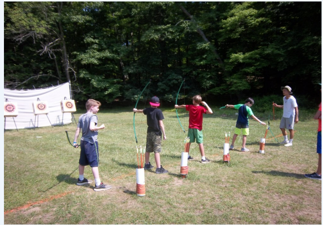
Archers practicing their skills