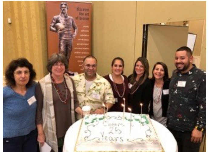
Photo: Members of the 2019 Downstate Committee.

The Downstate Event offered 25 concurrent sessions, an exhibit showcase and lunch for 180 delegates, 27 presenters and 23 vendor exhibitors. Planning for the 2020 Downstate will start soon.